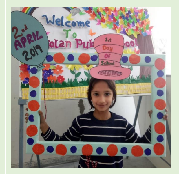
1st Day Welcome @ SPS