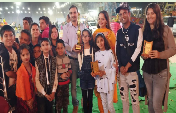
Bang 1<sup>st</sup> Prize in Himachal Utsav 2019