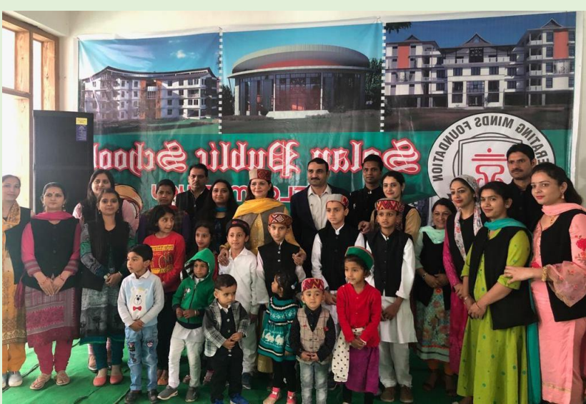
Himachal Day Celebration