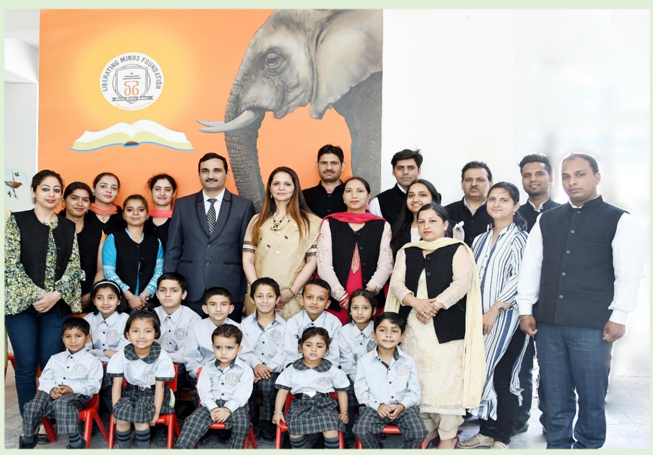
SPS Family – AY – 2019 – 2020 We welcome you to join us in Academic Year – 2020 – 2021