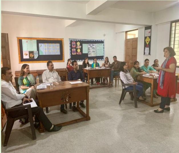
Professional Development Sessions for the teachers